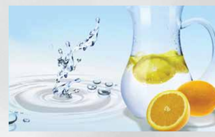
Fresh Heat water just when you need it