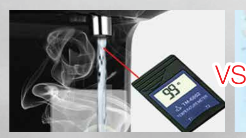
Power saving Boiling water in 2 seconds