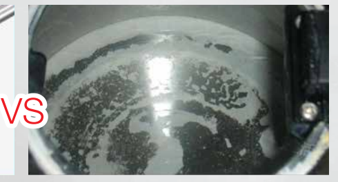
Harmful Repeated boiling