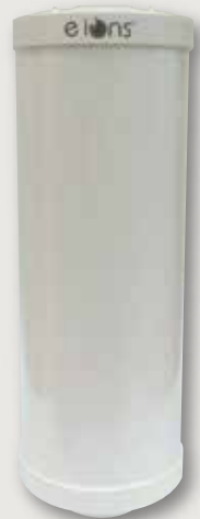
4 in 1 Filter