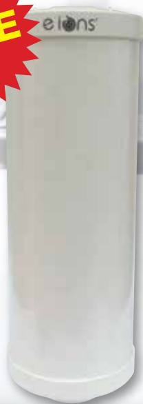
4 in 1 Filter