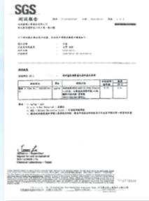
SGS Test Report