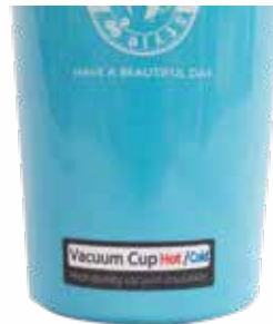
Food-graded PP Plastic Materials