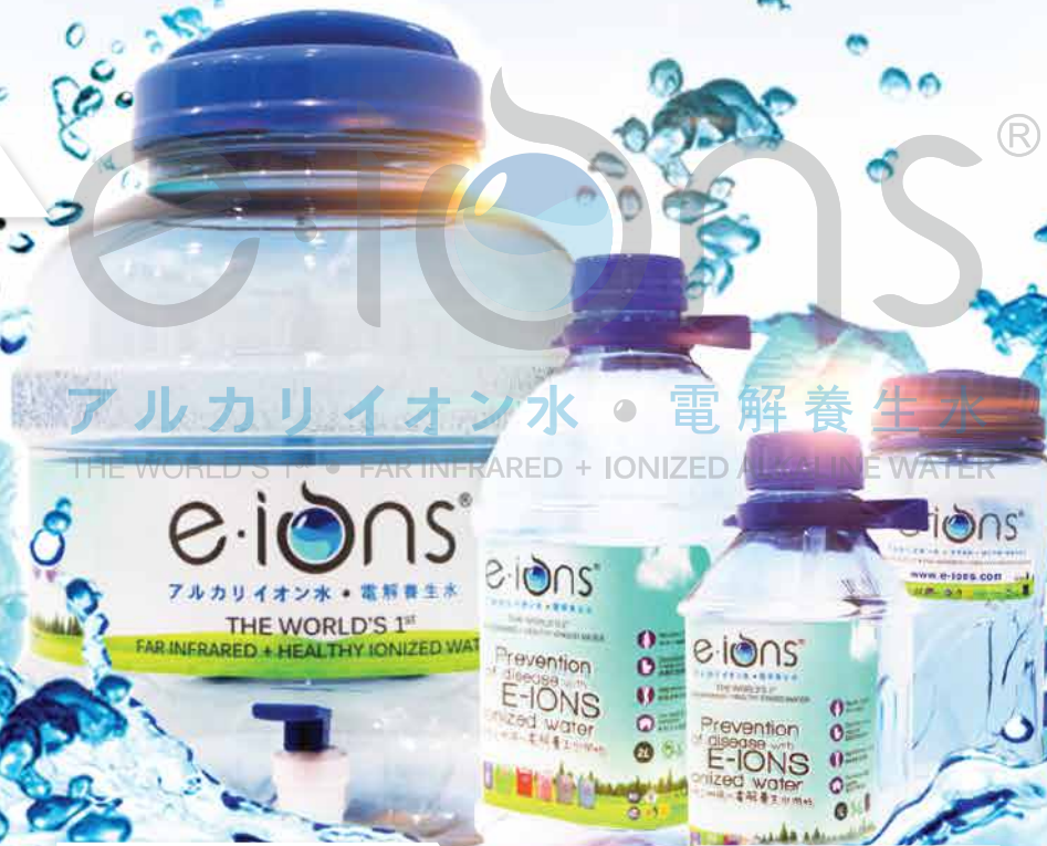
1L Bottle (Round)