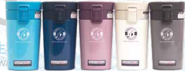
Light Blue Deep Blue Purple White Grey