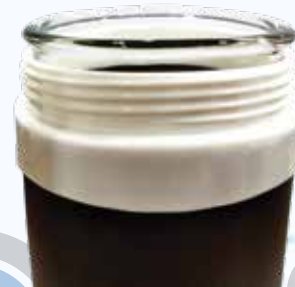
Tempered Glass with Protector