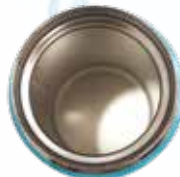
Food-graded Stainless Steel

アルカリイオン水・電解養生 THE WORLD'S BEST INFRARED + IONIZED ALKALINE WATER