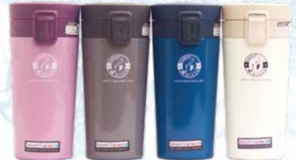
Purple Grey Deep Blue White